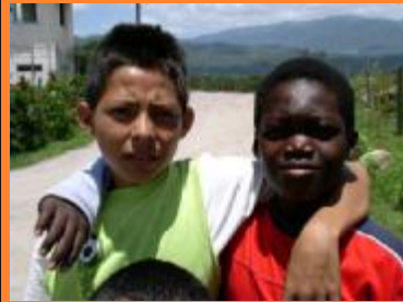
Friendship = Brotherly love!!!

Touching the Life of a Child.....Changing the Heart of a Nation. But Jesus beheld them, and said unto them, With men this is impossible; but with God all things are possible. Matt. 19:26