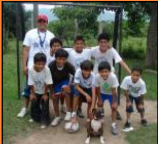
Kids are winners!!